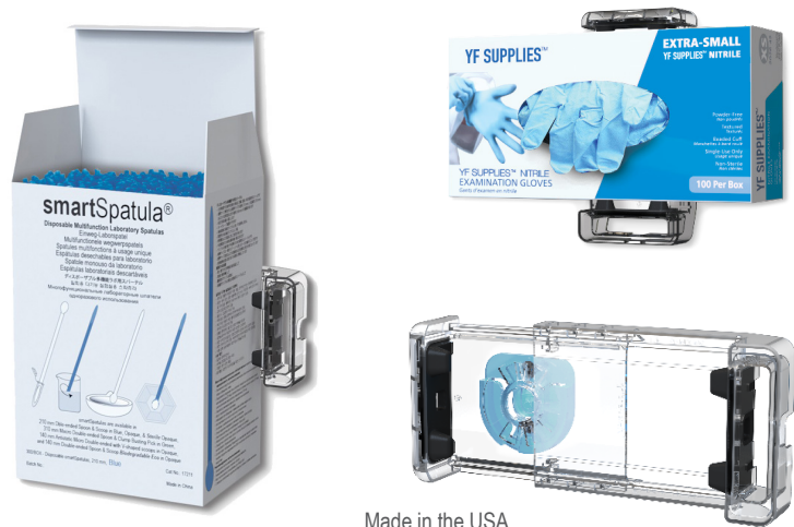
Made in the USA

The LevGo universal, rotating, and expanding Dispensing Box Holder, is the ONLY holder that easily expands from 95 to 155 mm (3.75 to 6 inches) to hold a variety of dispensing boxes, containers and small electronics (power cord pass-through port built-in).