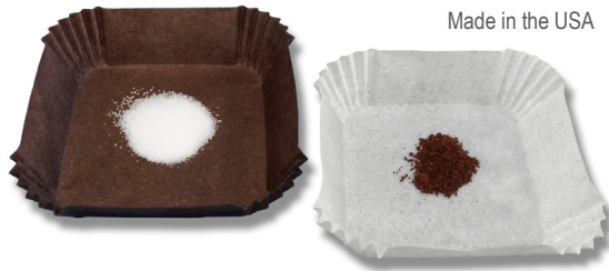
Made in the USA

The LevGo Paper Weighing Boat is easier to handle than weighing paper and is a simple, cost-effective solution to reduce plastic use in the lab. Made of grease proof FSC® Mix Paper that meets FDA 21 CFR 176.170 (components of paper in contact with aqueous and fatty foods) and with 21 CFR 176.180 (contact with dry foods). Compatible with heat applications with a temperature limitation of 210 °C. The LevGo Paper Weighing Boat is available in both brown for light colored samples and white for dark samples. Our medium sized boats are made in the USA.