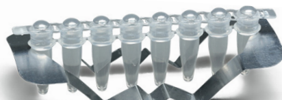
Made in the USA

The LevGo Multifunction Support Rack reduces the inconvenience of weighing paper by providing much needed structural support when manipulating precious samples. No more creased paper suddenly flopping closed. No more samples trapped in weighing paper that is pinched closed too tightly. No more sample spilling during transfer. With the LevGo Multifunction Support Rack your sample is easily moved from scale to beaker. The unique stand is also a universal rack for the lab. Bend it to your needs. Prop up your strip of micro tubes, support your spatula on the bench, or keep your 1.5 ml tube from disappearing in the ice. Squeeze, stretch, bend and mold the rack to customize it to your specific needs.